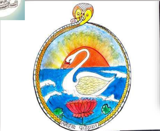
Maitri Kunda Class-III