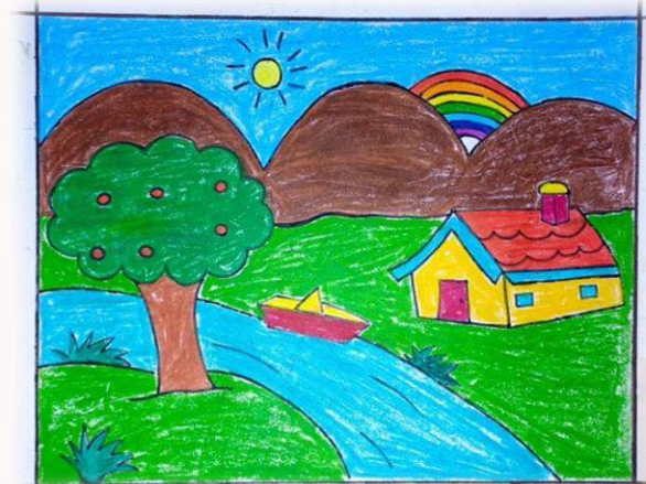
Mohor Das Class- Transition