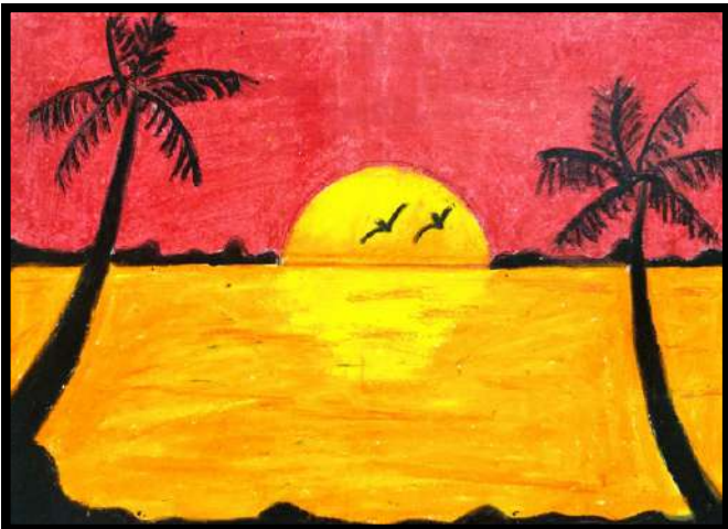
PUSHPADRITA SARKAR CLASS 5