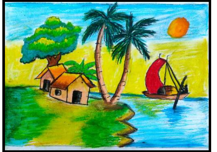
SRIJITA MANDAL CLASS 4