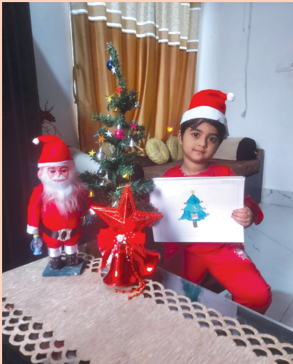
Students of Lower Primary and Primary Section celebrated Christmas as part of their online class activity.

"Leaders don't convince people to follow them. Leaders walk forward alone and those who want to go down their path decide to follow." Our Late Founder Sir's birth anniversary was observed on 15th December.